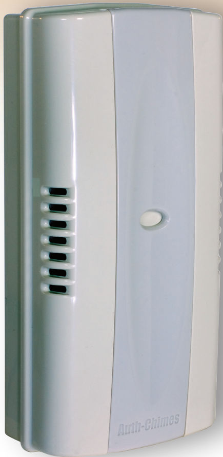
Auth-Chimes Cover with spring-activated sliding viewer